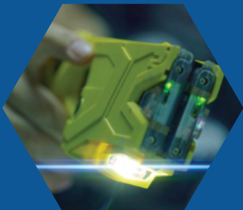
TASER ® Training