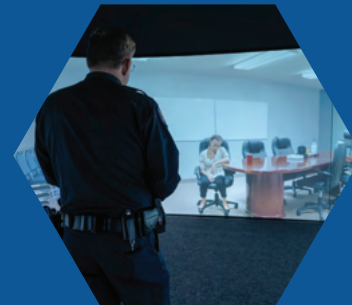
Mental Health Awareness